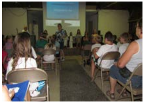
Talent Night at Kid's Camp 2013

This year at Kid's Camp, we will learn that "More IS Better"! But you may be asking "what do we need more of"? During the week, kids will learn that instead of wanting more material things of this world, we could all use more hope, more love, more power, more purity, more grace, and most of all, more of Jesus!